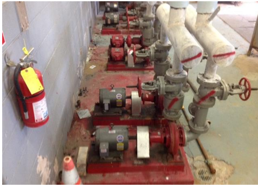
Carusi: Old Boiler Pumps (top) New Energy Efficient Pumps (bottom)