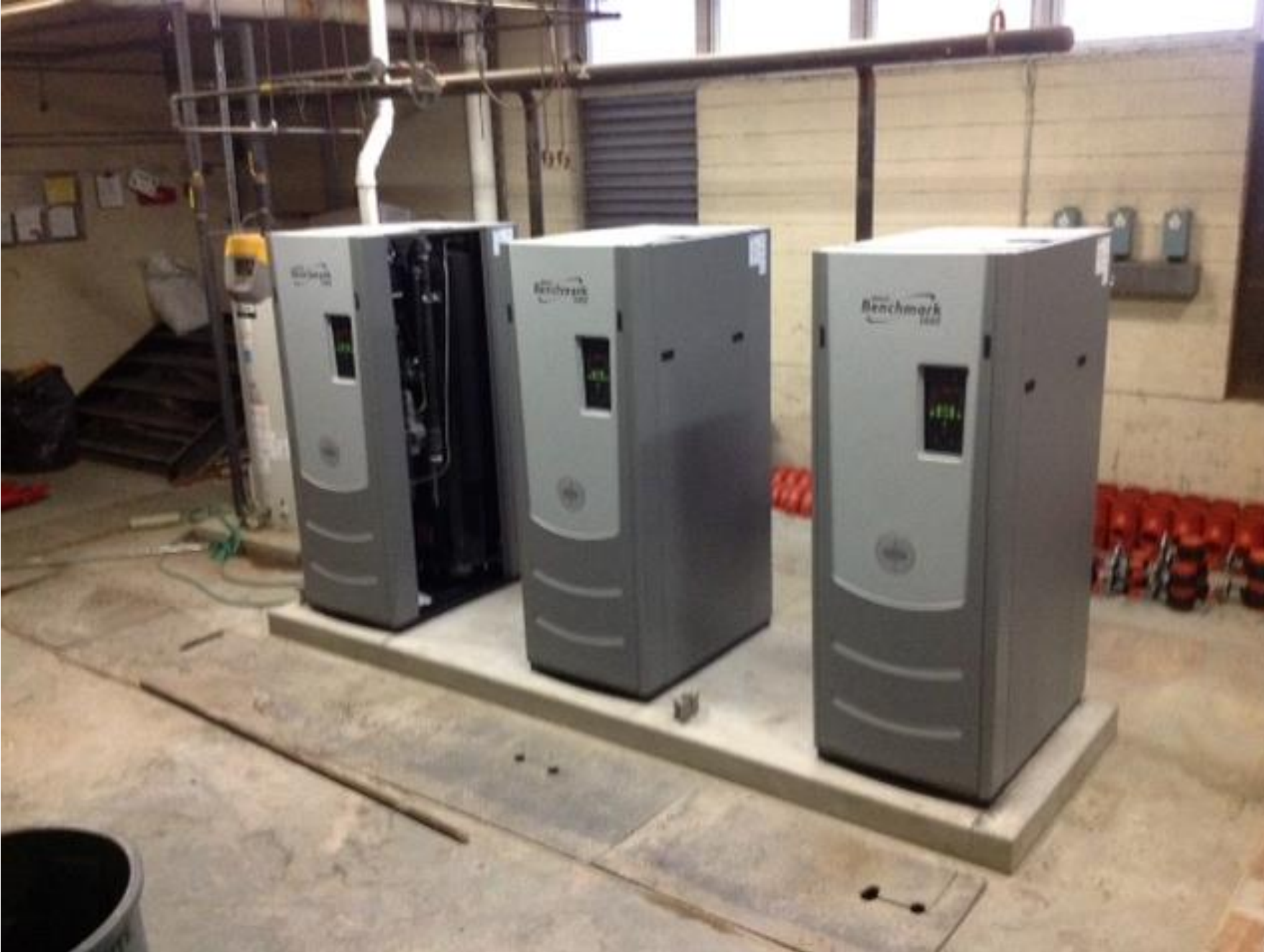
Carusi – New Boilers in Place