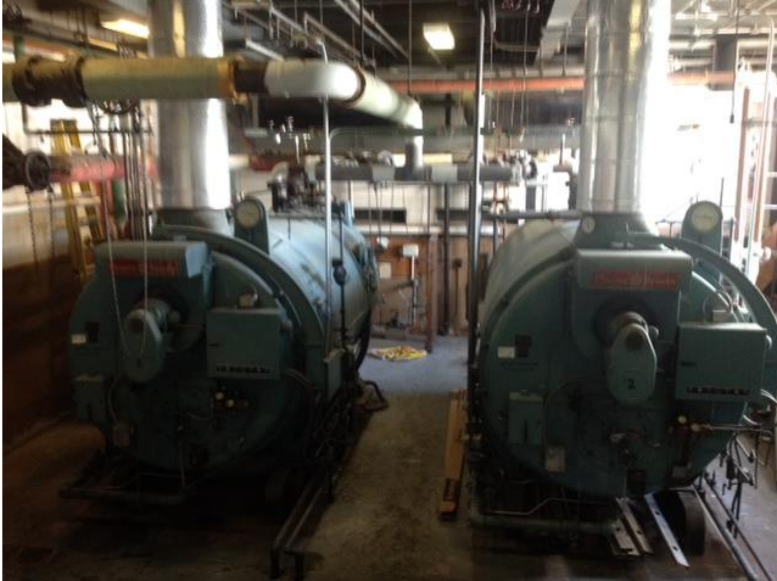
Rosa Before Boiler Demolition