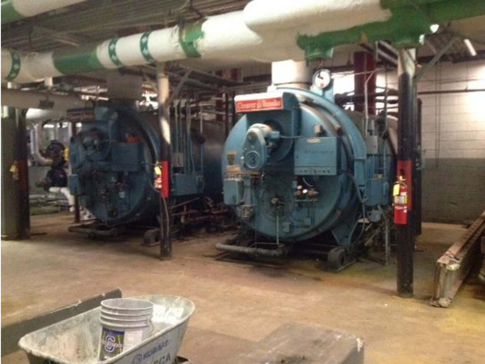
High School East – Old Boilers