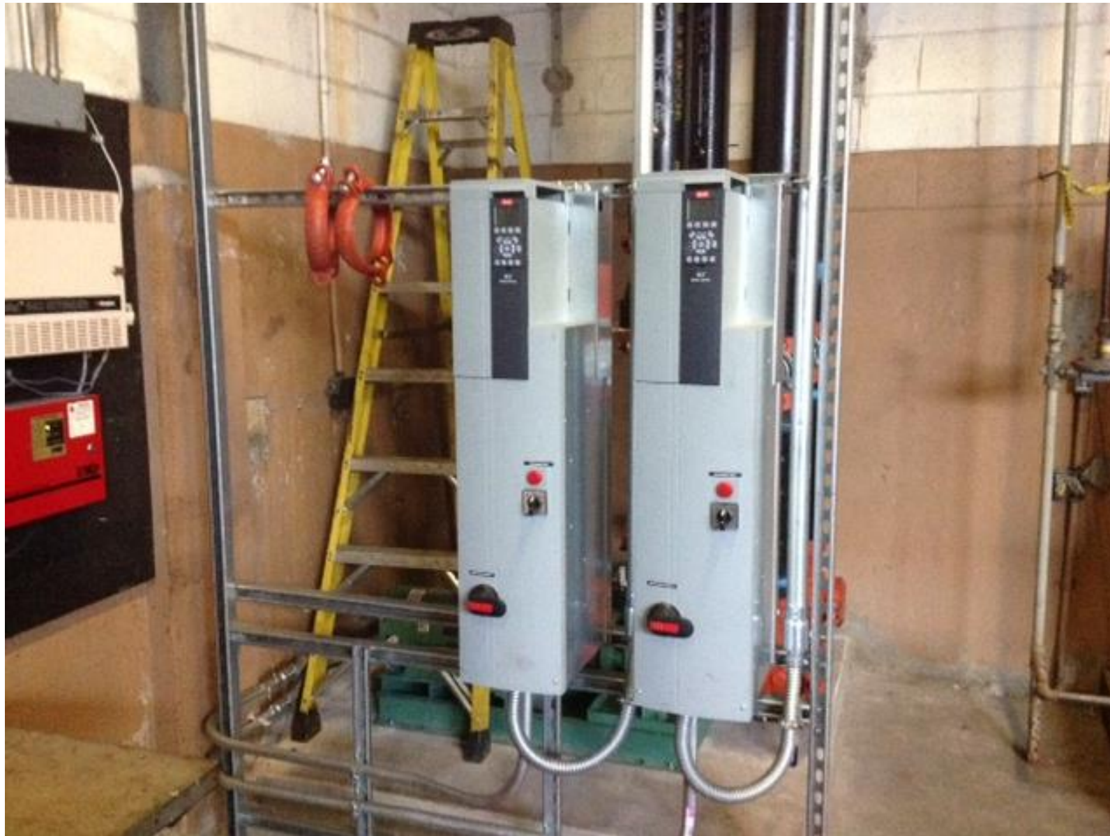
Rosa - New Boiler Pump Drives