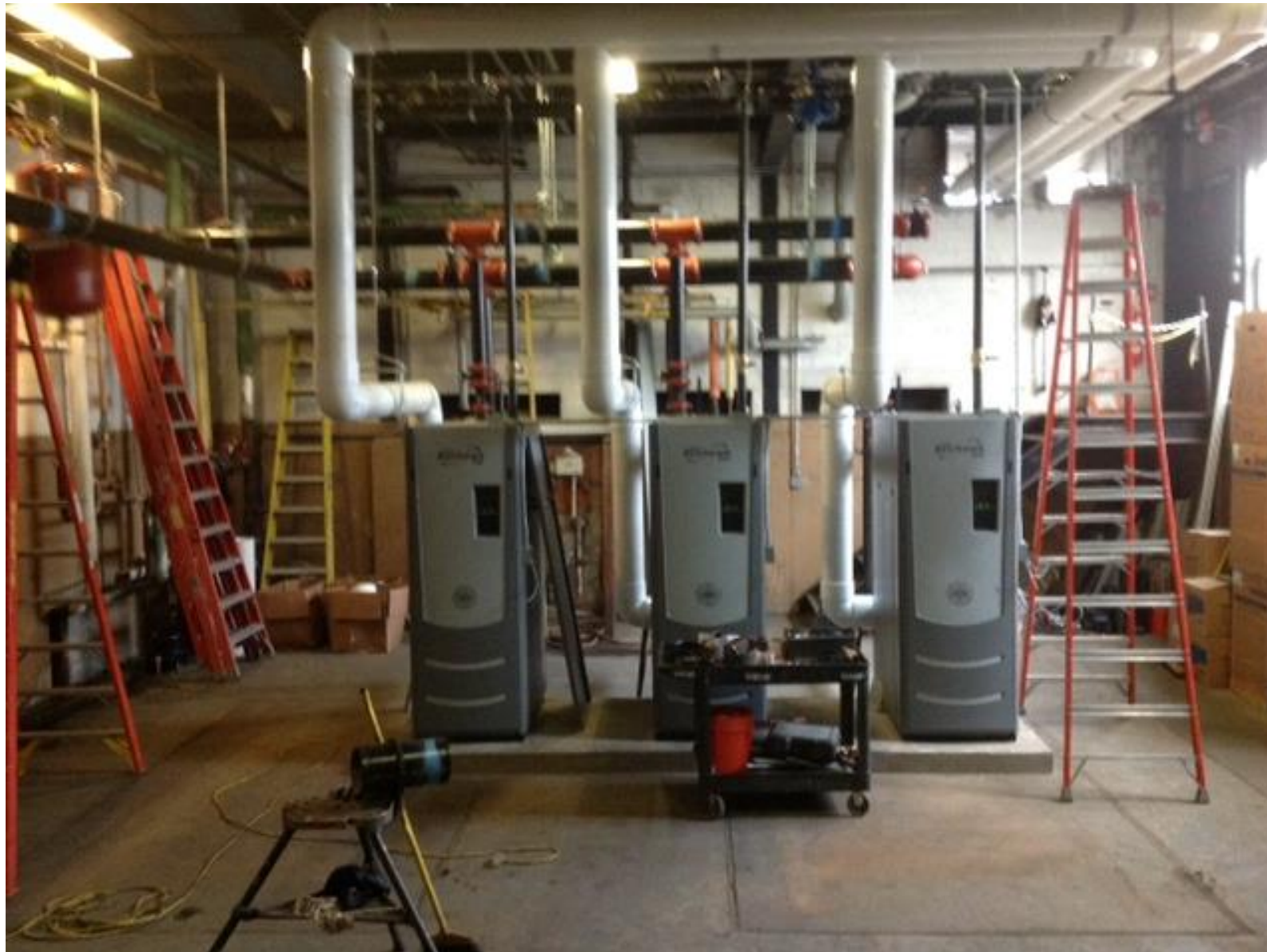
Rosa - New Boilers Installed