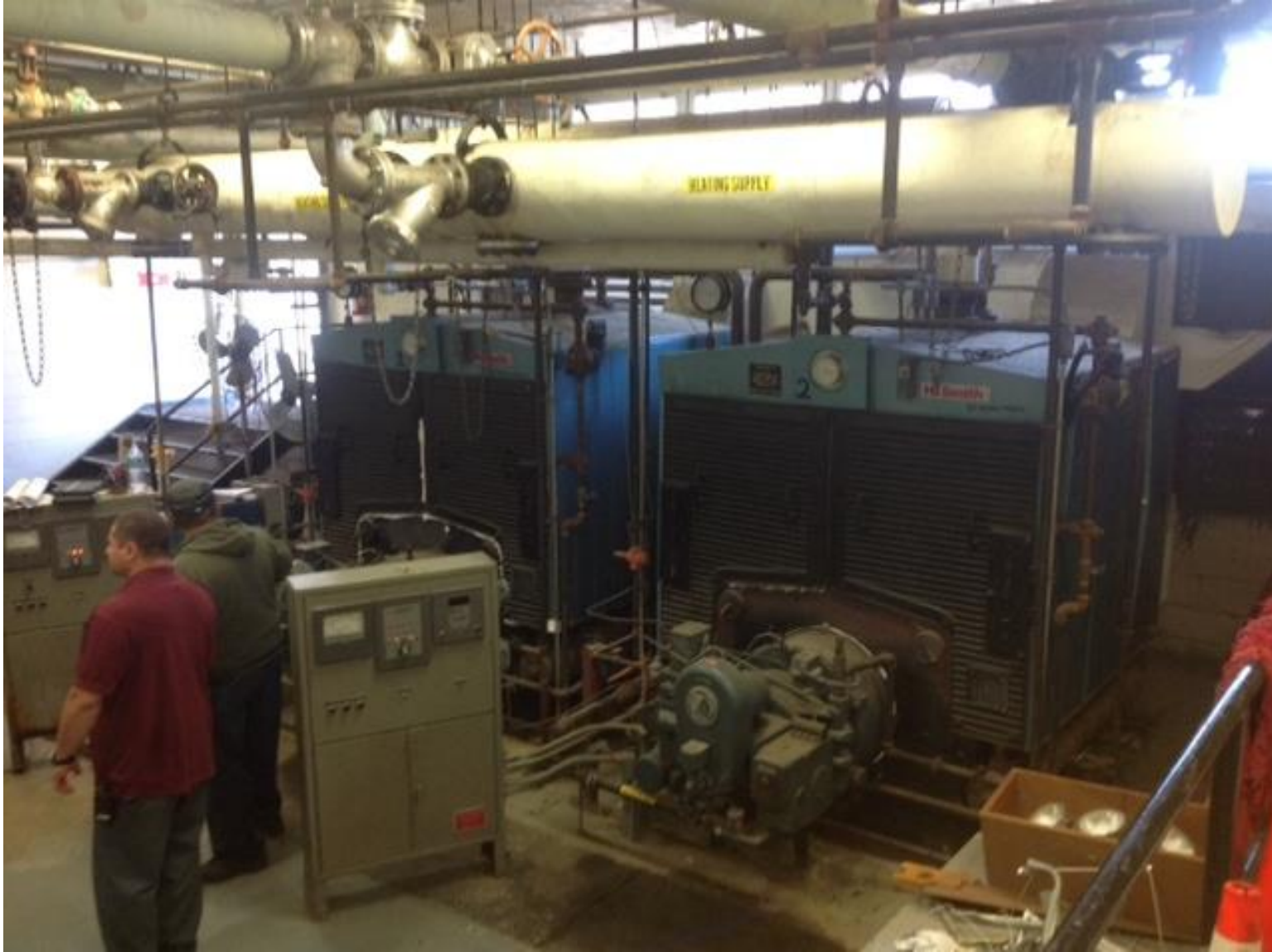
Carusi – Boiler Demolition Begins