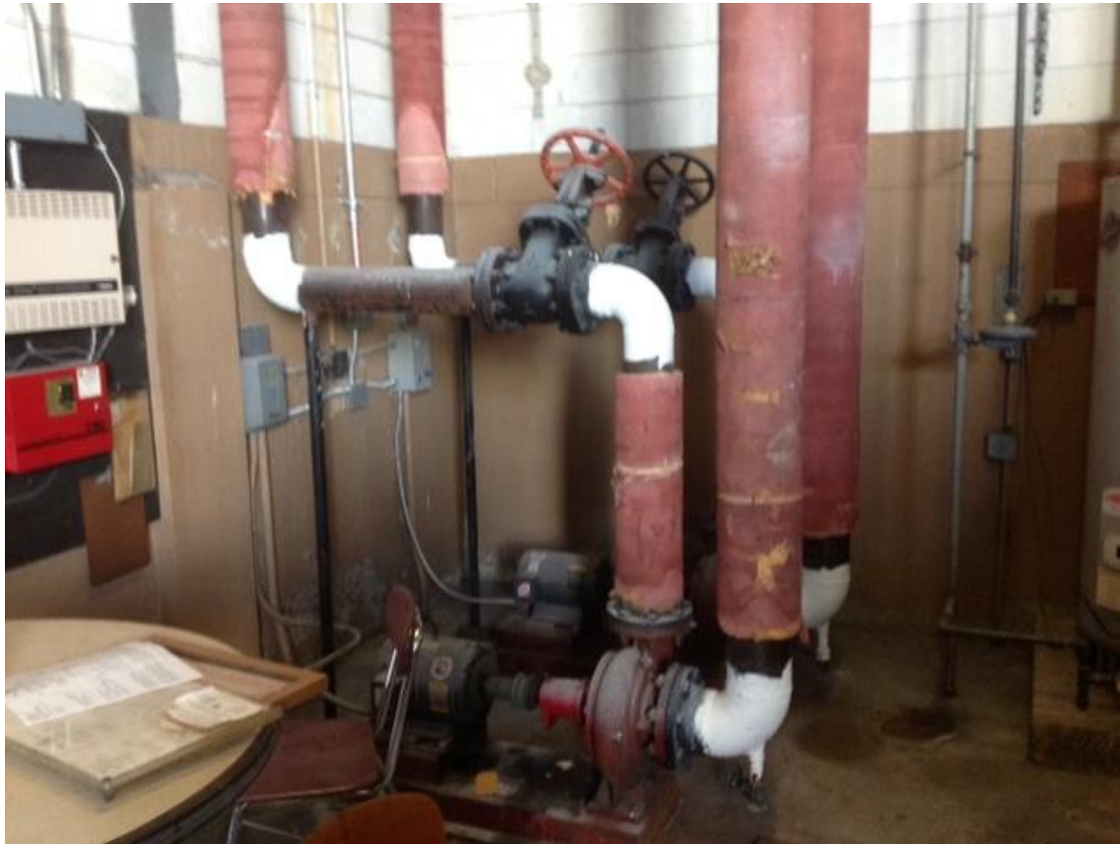
Rosa - Old Boiler Pumps